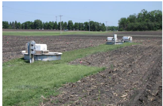
Plots to collect drainage water were established at the Southern Research and Outreach Center in Waseca in 1975. The collection of data was automated in 2009.

Research data on nitrate loss from cropping systems through drainage systems is not as common as one might think. In Minnesota there are plots used to measure drainage water quantity and quality located at the University of Minnesota Research and Outreach Centers in Waseca (SROC) and Lamberton (SWROC). These were established in the early 1970s. In the nearly 40 years that these plots have been used, they have examined many of the aspects of N management including: rate, application timing, source, and the use of nitrification inhibitors. In addition, they have looked at various crops grown in rotation, tillage practices, and mineralization of N from soil organic matter.